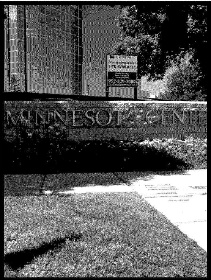
L2 - Landmark Letter Set Sign will be Removed when Hotel Construction Begins