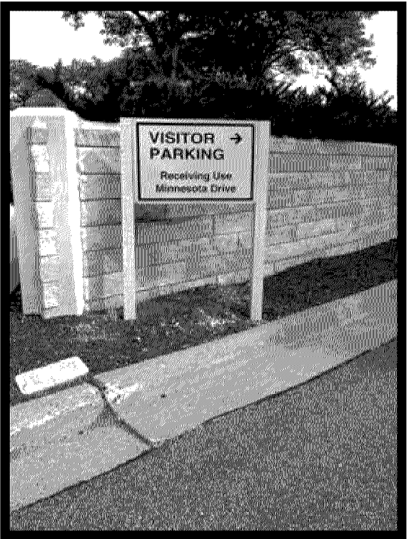
D1 - Directional Sign