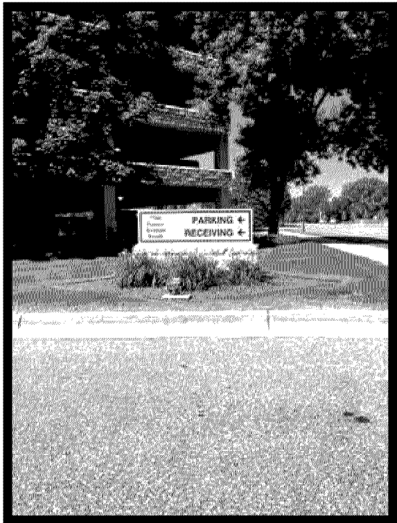
DM1 - Multi-tenant Monument