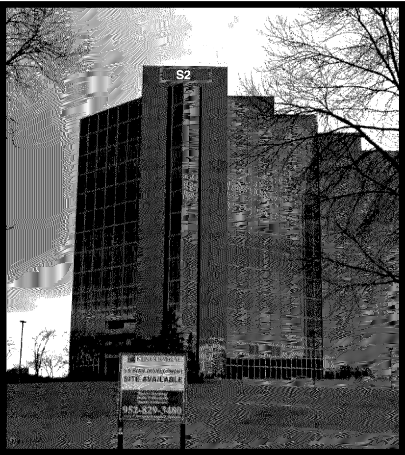
S2 - Secondary Elevation for Signage North Elevation