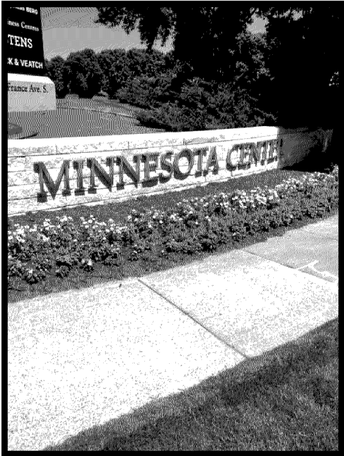
L1 - Landmark Letter Set