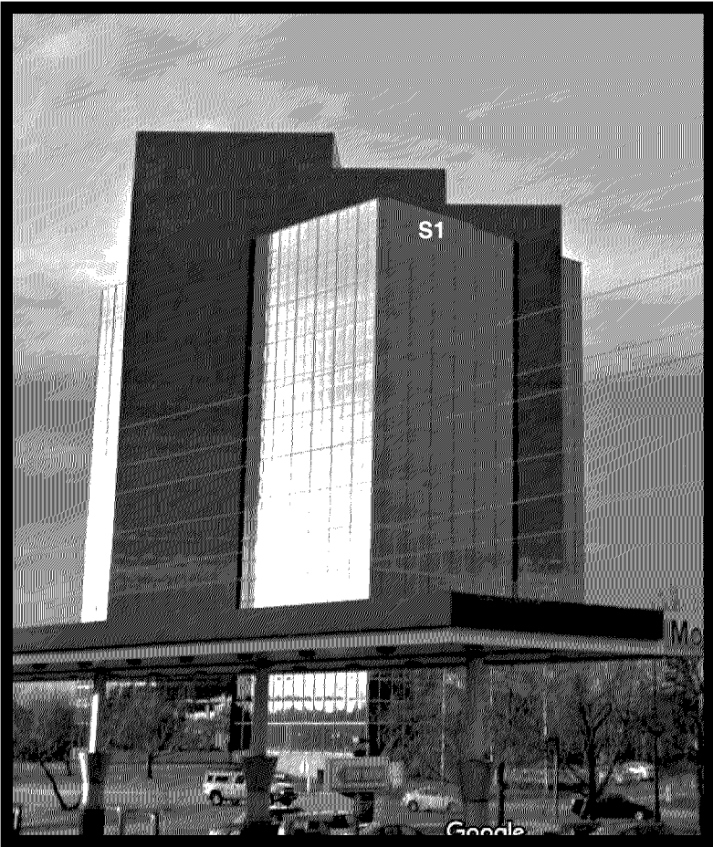
S1 - Secondary Elevation for Signage East Elevation