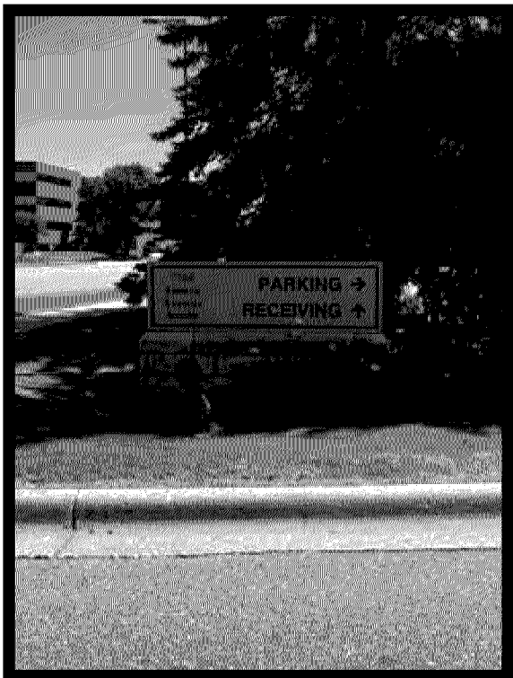
DM2 - Multi-tenant Monument