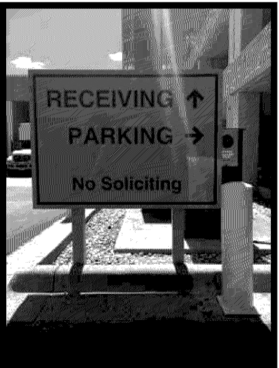
D2 - Directional Sign