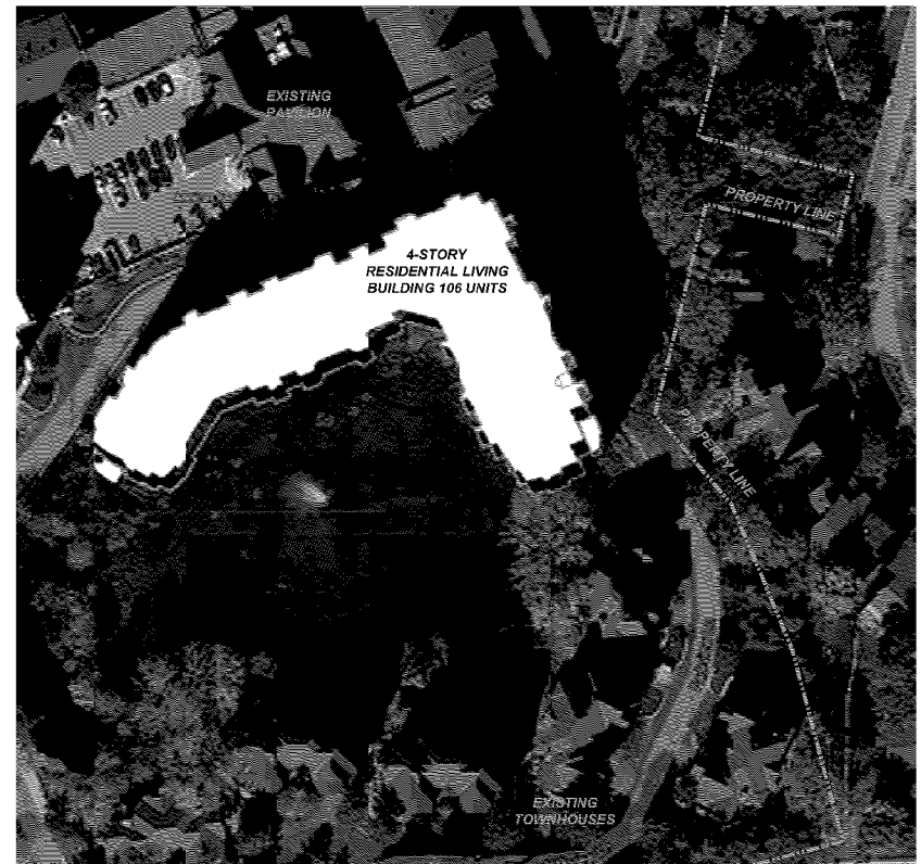
SHADOW STUDY - DEC 21, 2 PM