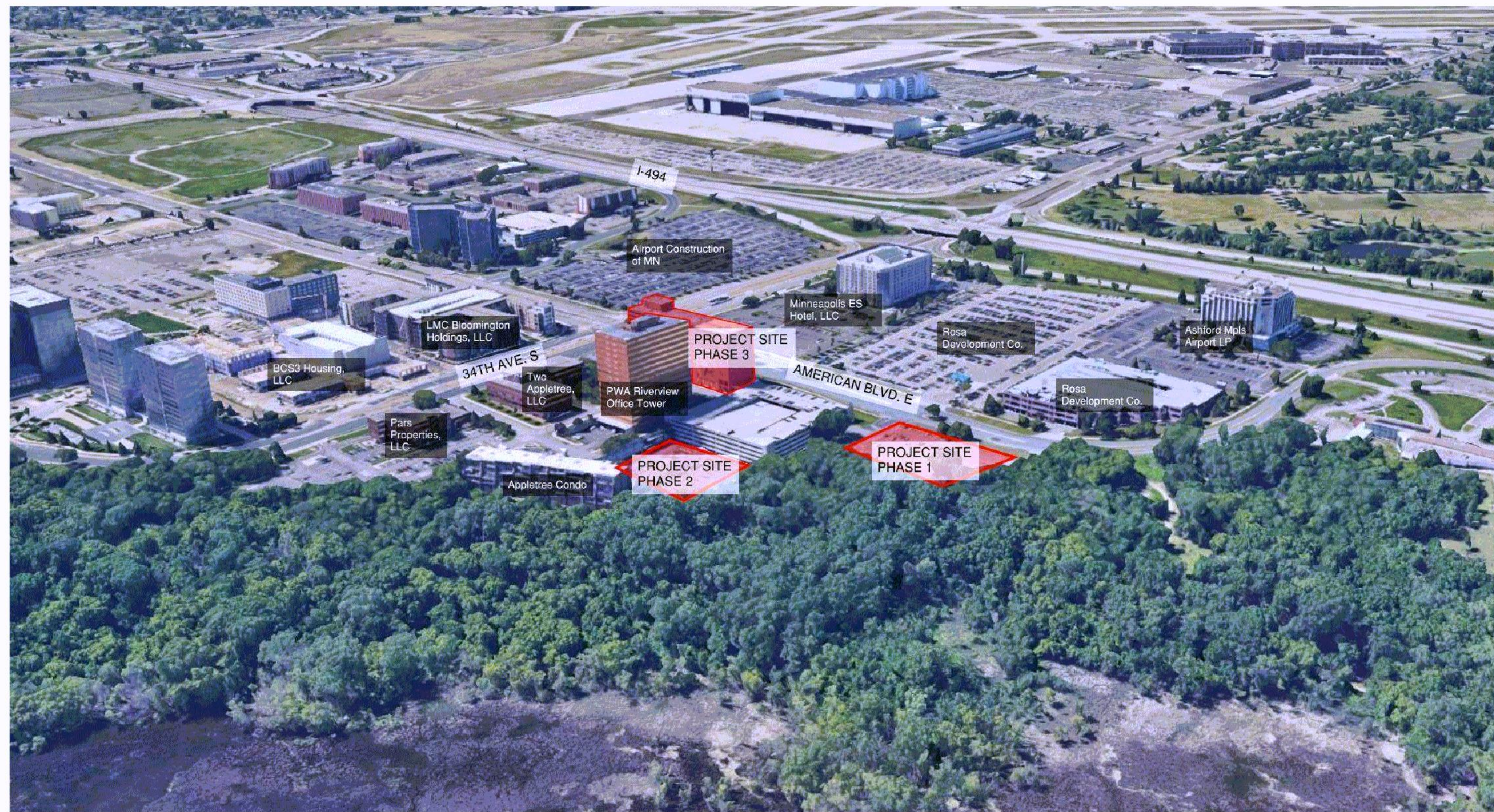
PROJECT LOCATION AERIAL VIEW WITH ADJACENT PROPERTY OWNERS