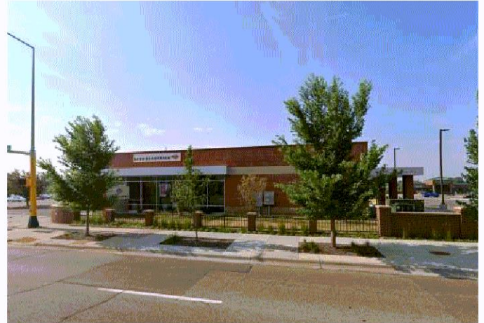
Bank of America 611 West 98th Street 4,202 square feet