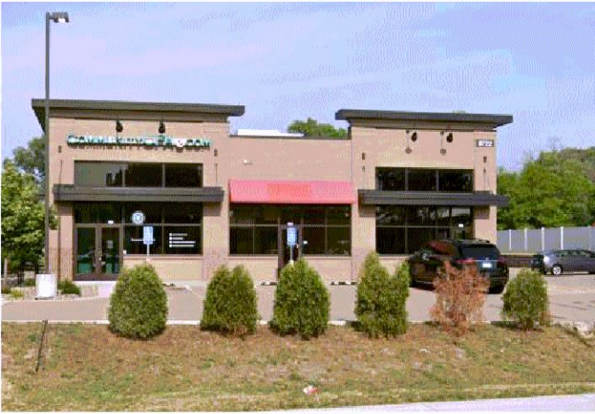
Three tenant retail building 8722 Lyndale Ave S 5,900 square feet