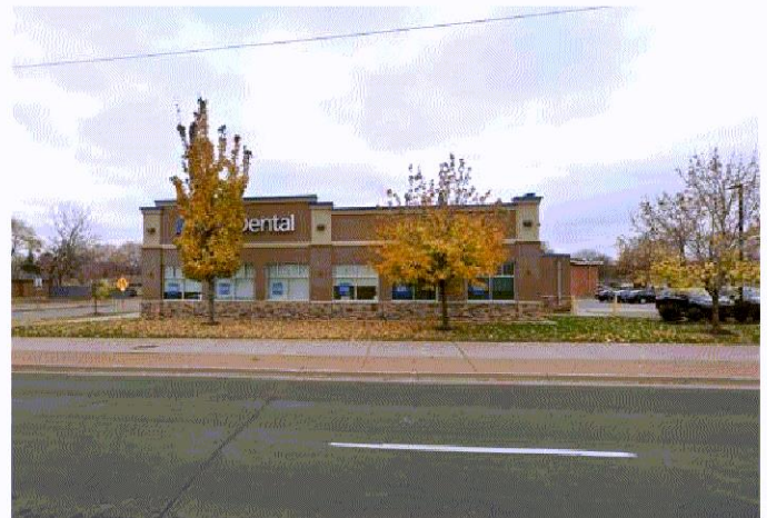
Aspen Dental Clinic 7936 Portland Ave S 3,384 square feet