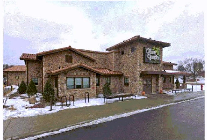
Olive Garden 4701 American Blvd W 9,527 square feet