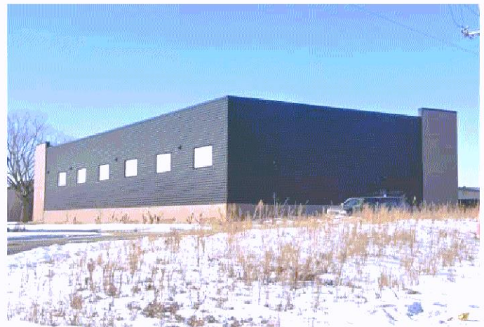
Donaldson Building Addition 1400 West 94th Street 14,000 square feet