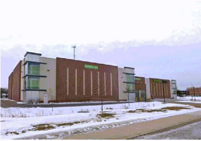
Extra Space 101 American Blvd E Three-story self storage 118,065 square feet (included CUP)