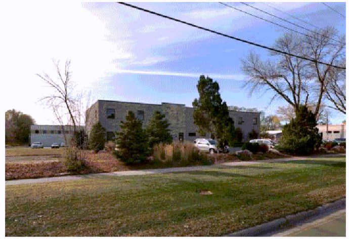
Yardscapes Warehouse 405 West 86th Street 6,000 square feet