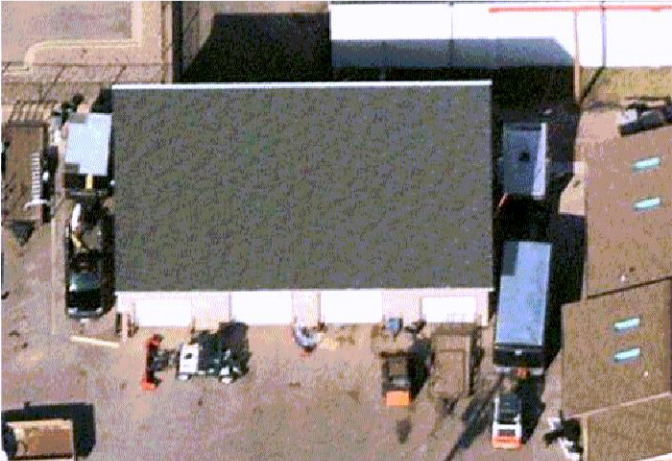
Urban Landworks Warehouse 301 W 90th Street 2,400 square feet