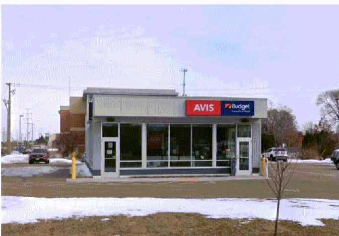
Budget Rent-a-Truck 305 American Blvd W 1,817 square feet