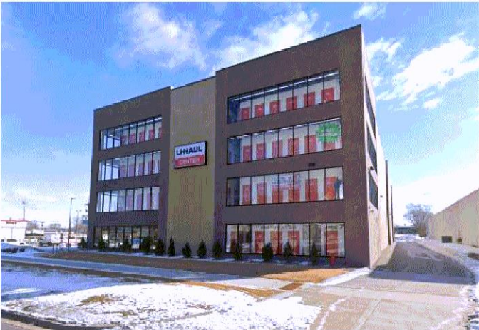
U-Haul Self Storage Facility 8901 Lyndale Ave 4 stories, 103,984 square feet (included CUP for self-storage use)