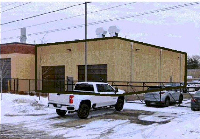
Walser Collision Addition 9001 Grand Ave S 4,200 square feet