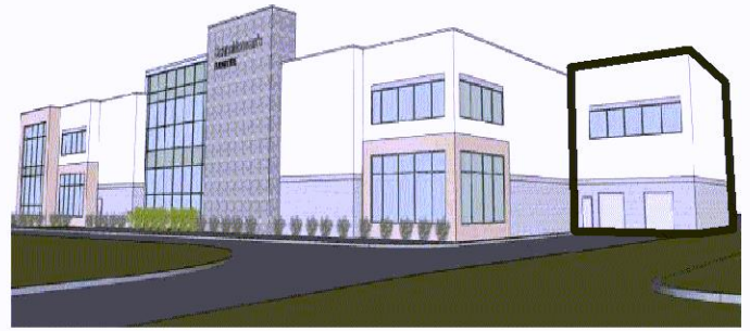
Schneiderman's Furniture Addition 2740 American Blvd W 4,076 square feet