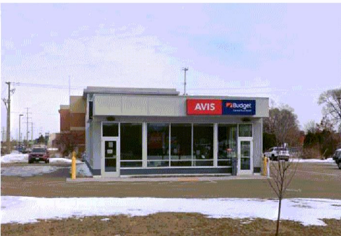
Budget Rent-a-Truck 305 American Blvd W 1,817 square feet