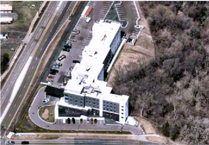
Hyatt House Hotel 2301 E Old Shakopee Rd Four story, 151-rooms, 98,744 square feet