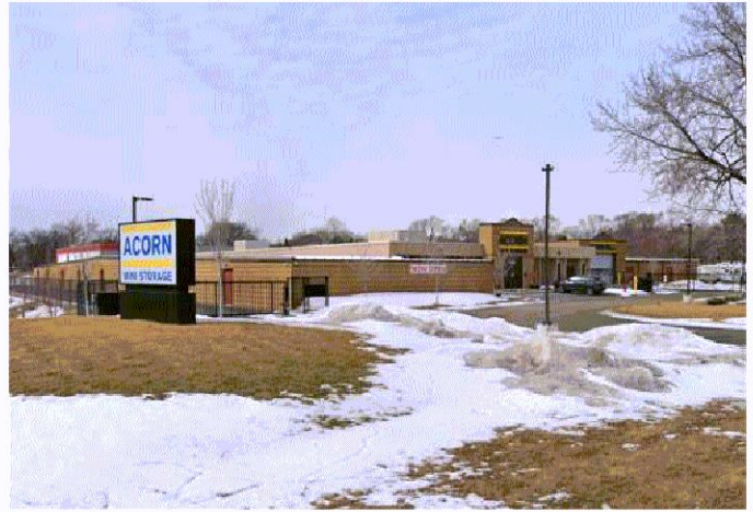
Acorn Self Storage 9100 W Bloomington Freeway 27,681 square feet added (included CUP)