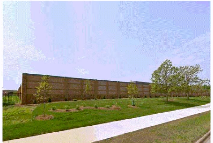
Verizon Wireless Facility Expansion 10801 Bush Lake Rd 17,000 square feet