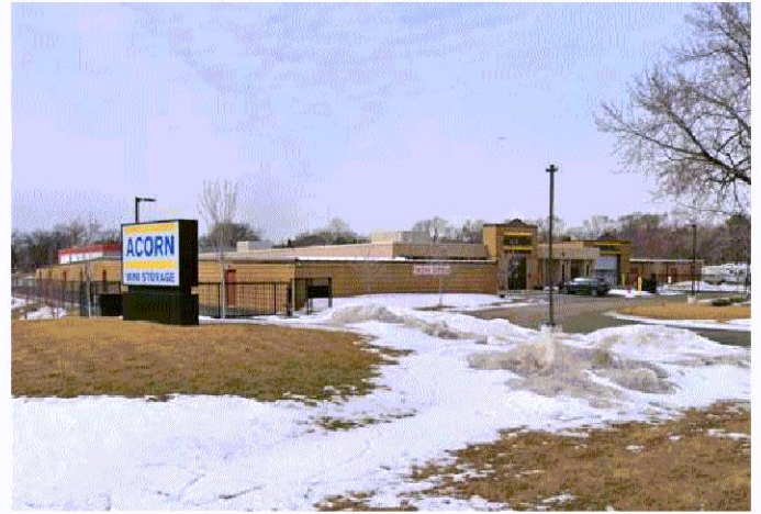
Acorn Self Storage 9100 W Bloomington Freeway 27,681 square feet added (included CUP)