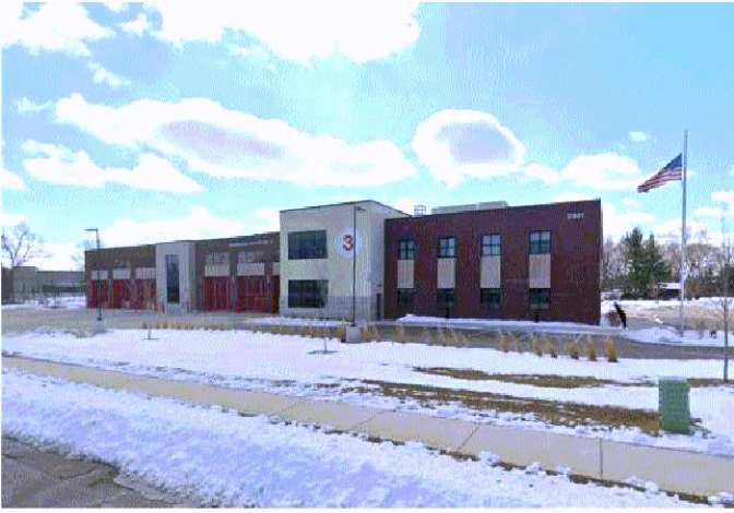
Fire Station #3 2301 E 86th Street 30,606 square feet