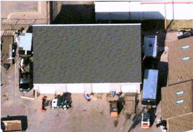
Urban Landworks Warehouse 301 W 90th Street 2,400 square feet