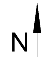
PROPOSAL WITH EXISTING SIDEWALK. SCALE: 1/16" = 1'-0"

PLAY GROUND DESIGNED AND INSTALLED BY: PLAYWORLD MIDWEST PLAYSCAPES, INC 8632 EAGLE CREEK CIRCLE SAVAGE, MN. 55378