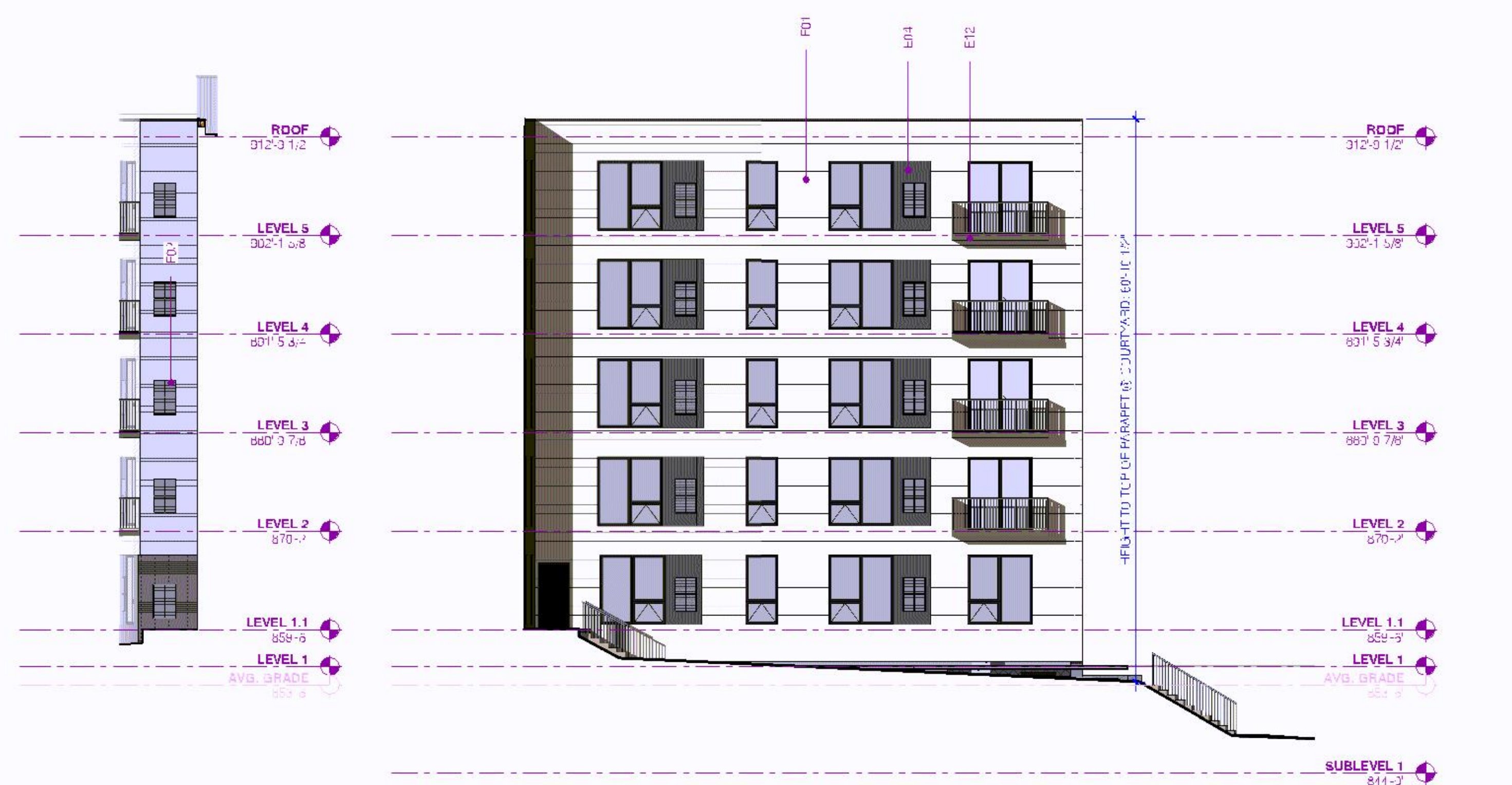
6 Elevation - West Courtyard Recess A302 3/32" = 1'-0"