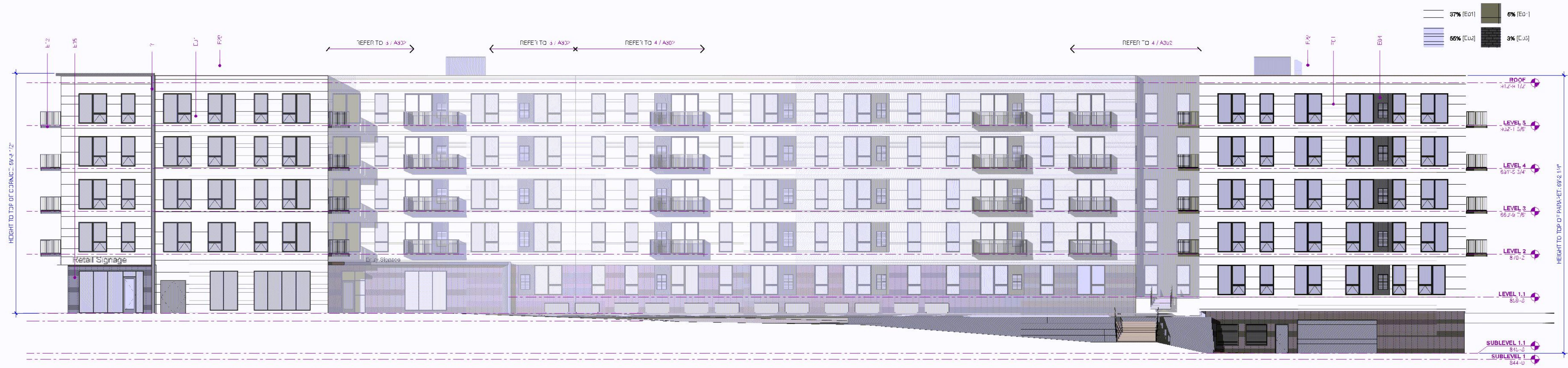
1 Elevation - North Overall A337 3/32" = 1'-0"