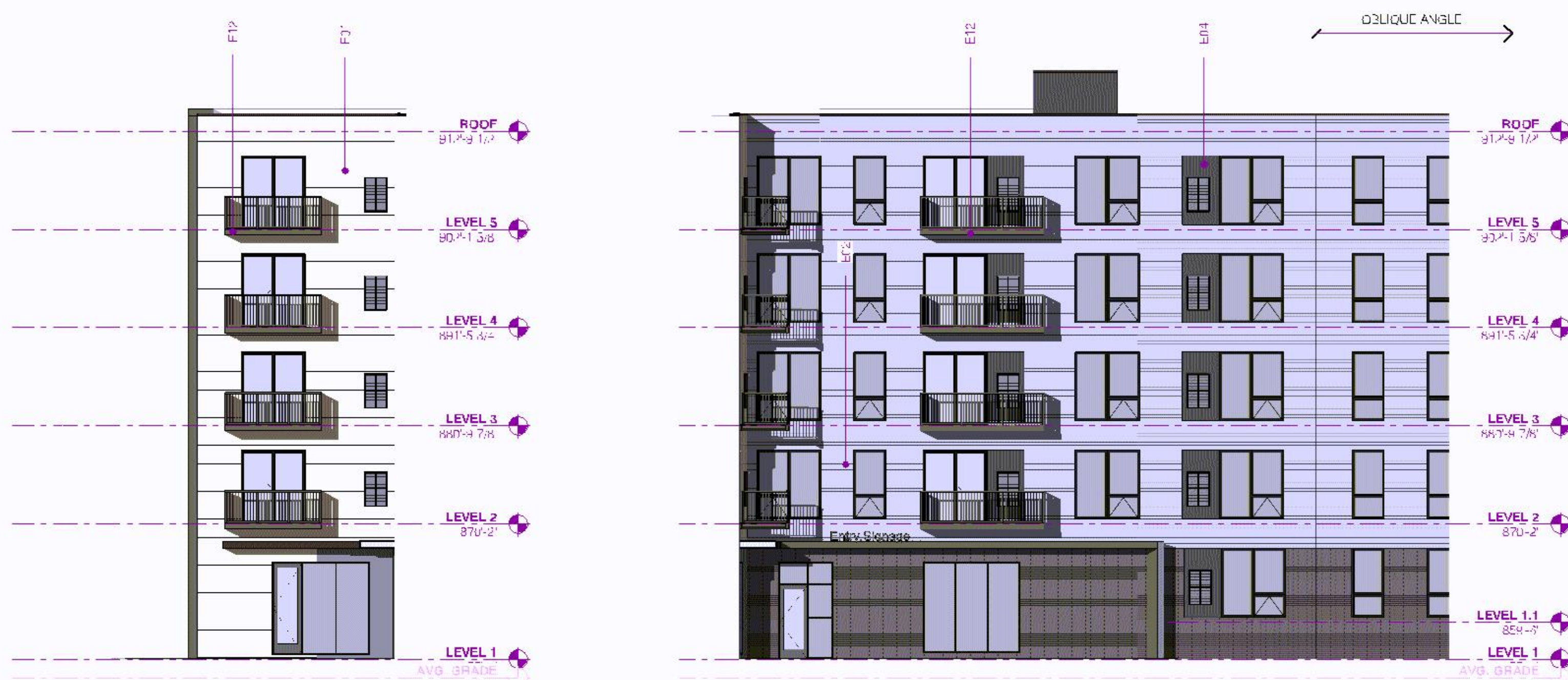
2 Elevation - Courtyard East A307 3/32" = 1'-0"