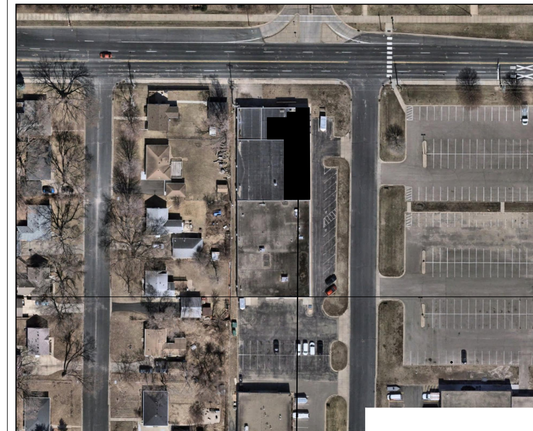
PROJECT AREA IS SHADED