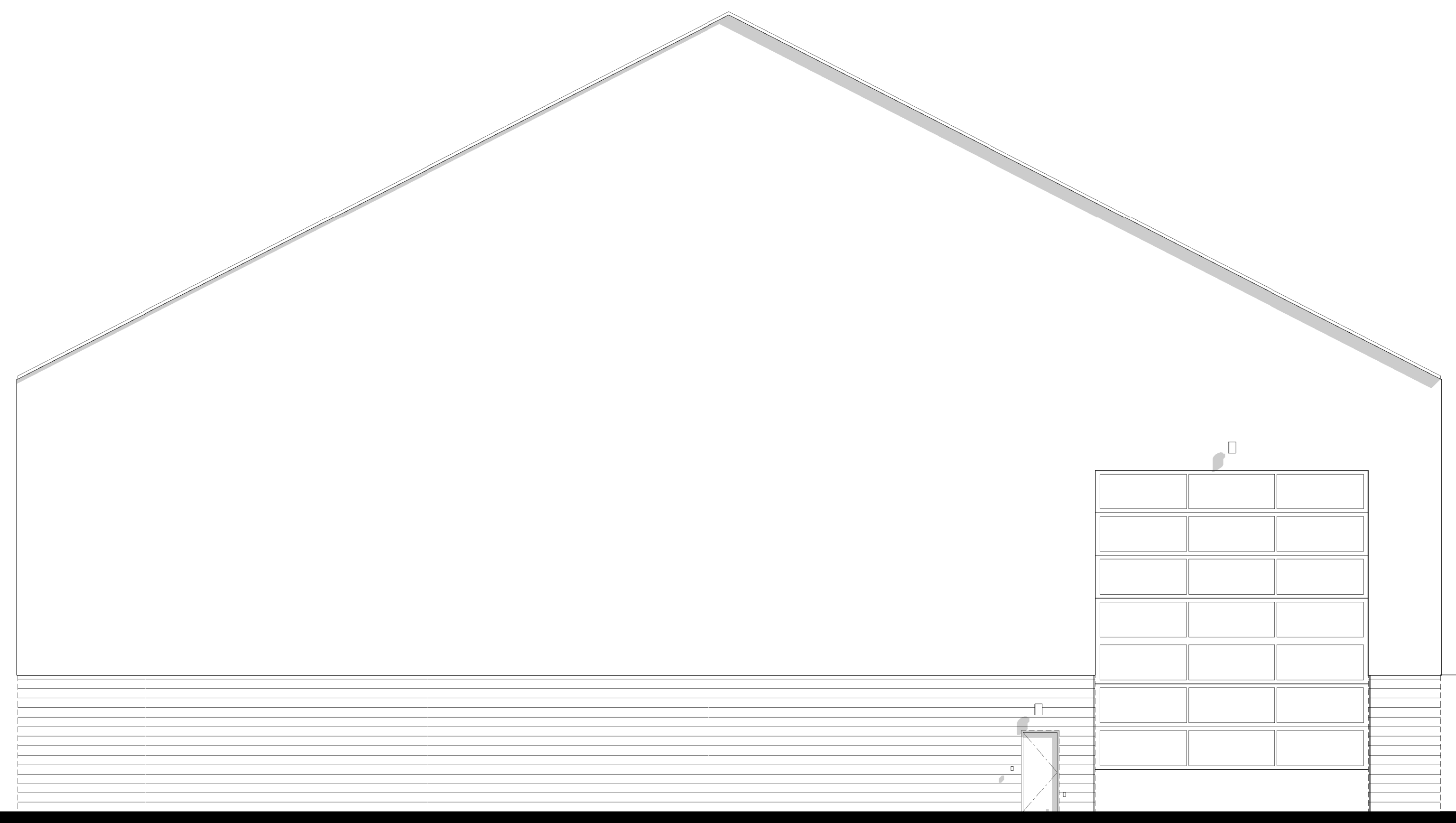
6C EXTERIOR ELEVATION - NORTH SCALE: 1/8" = 1'-0"